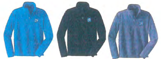
Port Authority® 1/2 Zip Fleece 13.8-ounce, 100% polyester