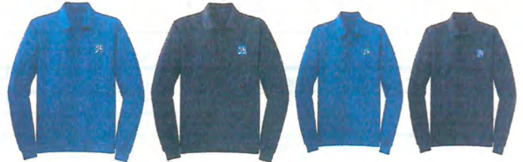
Port Authority® Long Sleeve Polo 5-ounce, 65/35 poly/cotton pique