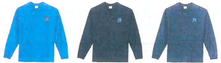
Port Authority® Long Sleeve TShirt Heavyweight 6.1-ounce, 100% soft spun cotton