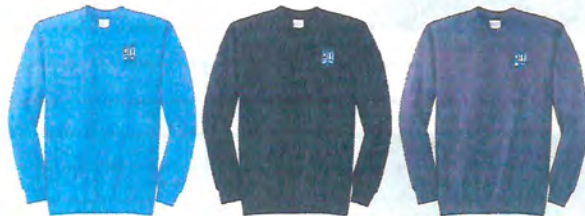
Port Authority® Crewneck Sweatshirt 7.8-ounce, 50/50 cotton/poly fleece