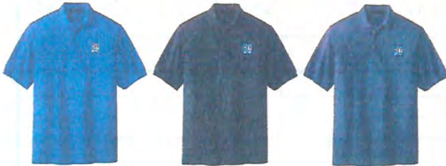
Port Authority® Short Sleeve Polo 5-ounce, 65/35 poly/cotton pique