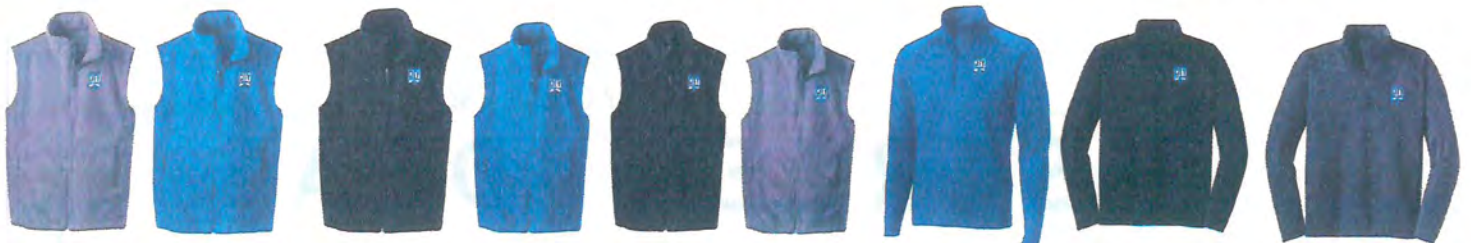
Port Authority® Fleece Vest 13.8-ounce, 100% polyester