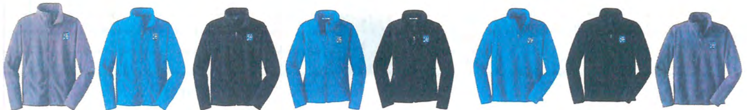
Port Authority® Full Zip Fleece 13.8-ounce, 100% polyester