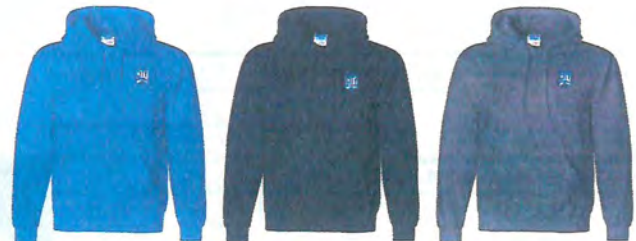
Port Authority® Hooded Sweatshirt 7.8-ounce, 50/50 cotton/poly fleece