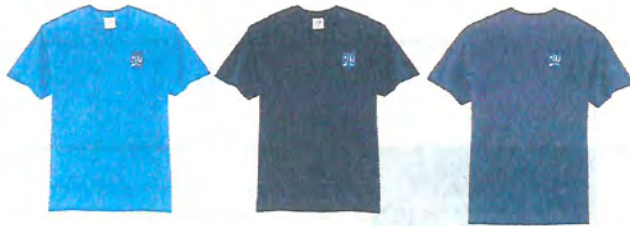
Port Authority® Short Sleeve TShirt 5.5-ounce, 50/50 cotton/polyester Blend